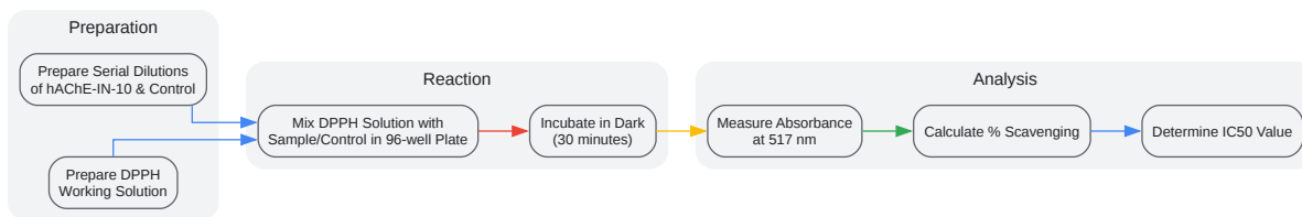
DPPH Assay Experimental Workflow

Click to download full resolution via product page