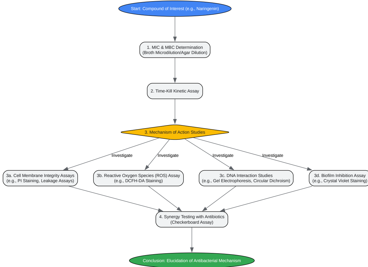
Figure 2: Experimental Workflow for Investigating Antibacterial Mechanisms

Click to download full resolution via product page