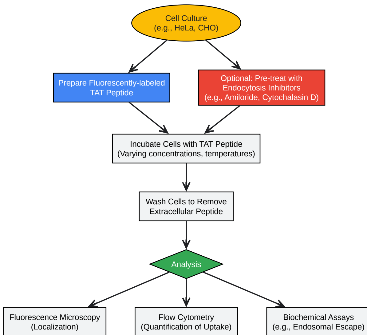
Figure 2: General Experimental Workflow for Studying TAT Translocation

Click to download full resolution via product page