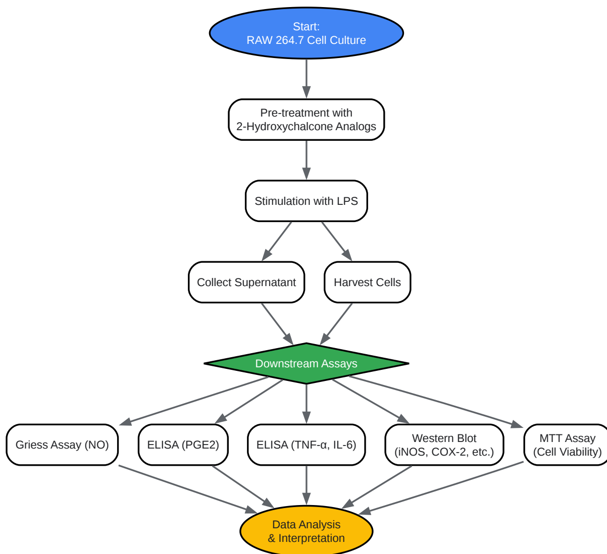
Figure 2: General Experimental Workflow

Caption: Simplified NF- \kappa B signaling pathway and the inhibitory action of 2-Hydroxychalcone analogs.