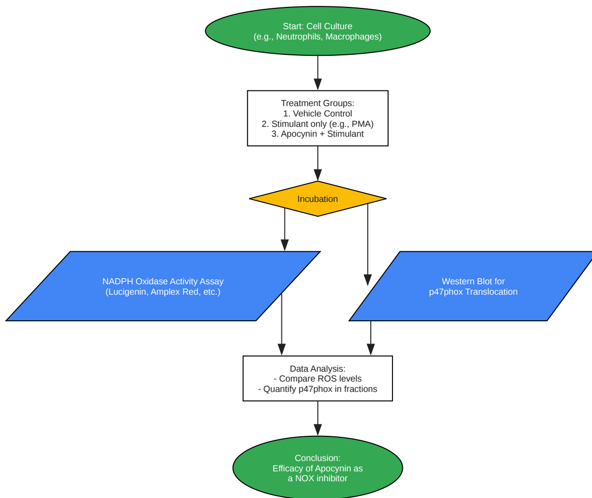
Figure 3: Experimental Workflow for Apocynin Evaluation

Click to download full resolution via product page