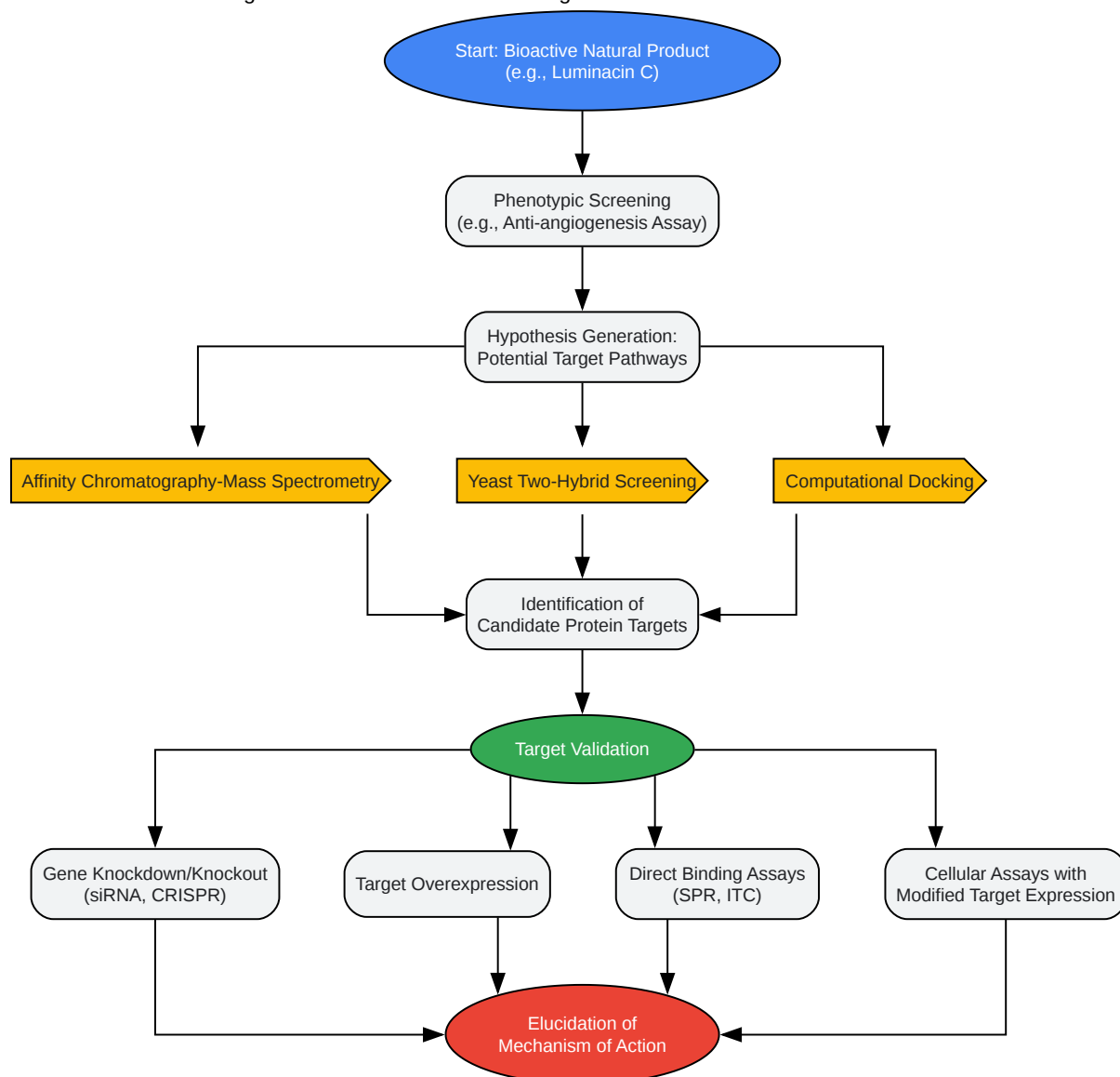
Figure 2. General Workflow for Target Identification of Natural Products

Click to download full resolution via product page