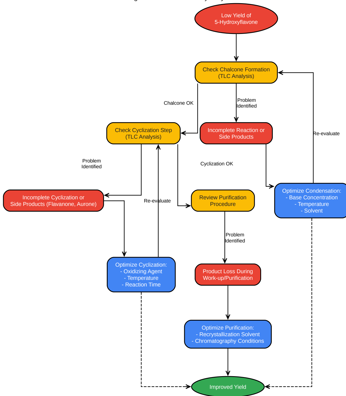
Troubleshooting Flowchart for Low 5-Hydroxyflavone Yield

Click to download full resolution via product page