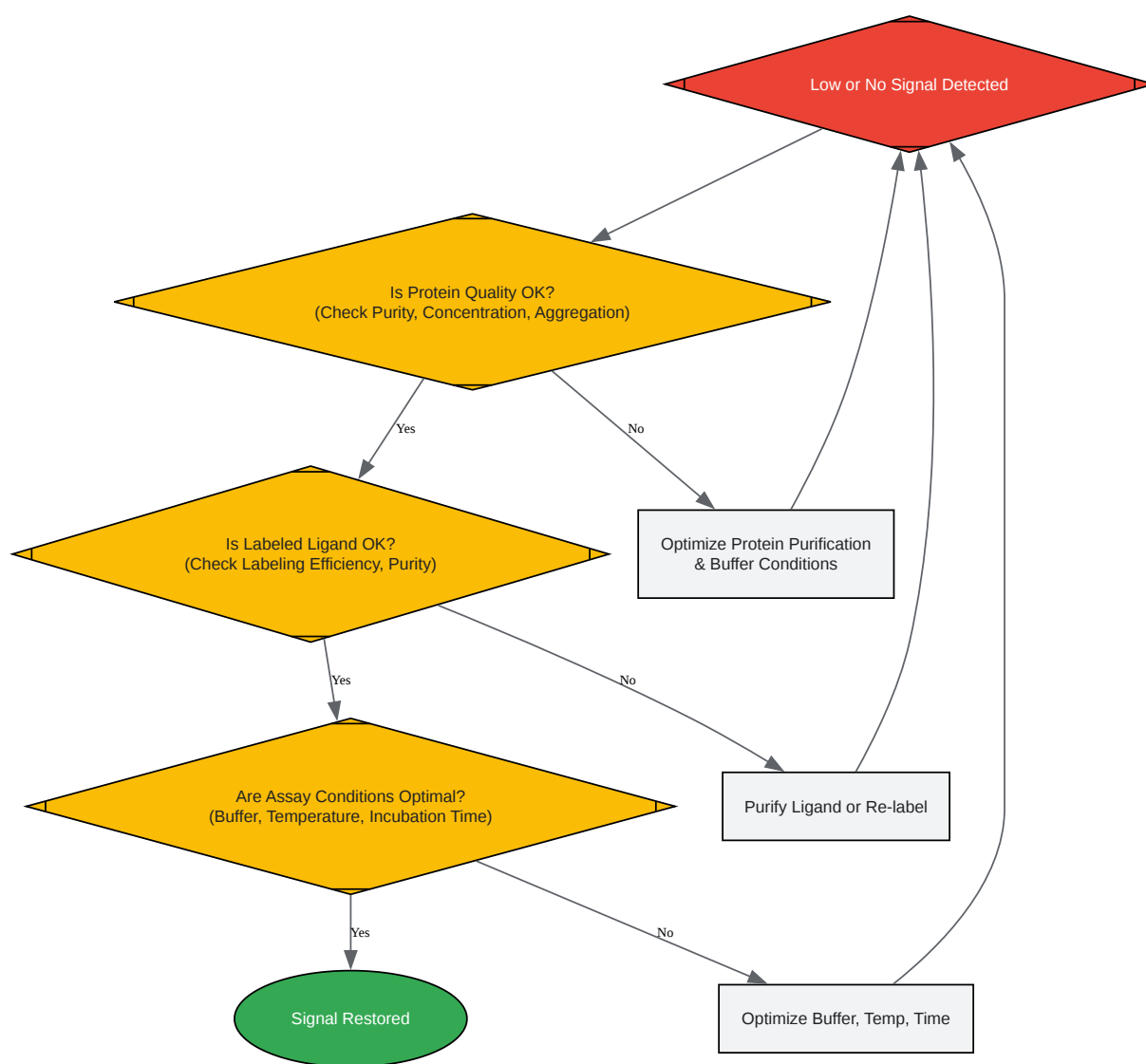
Diagram 3: Troubleshooting Logic for Low Signal

Caption: A generalized workflow for performing a direct protein-peptide binding assay.