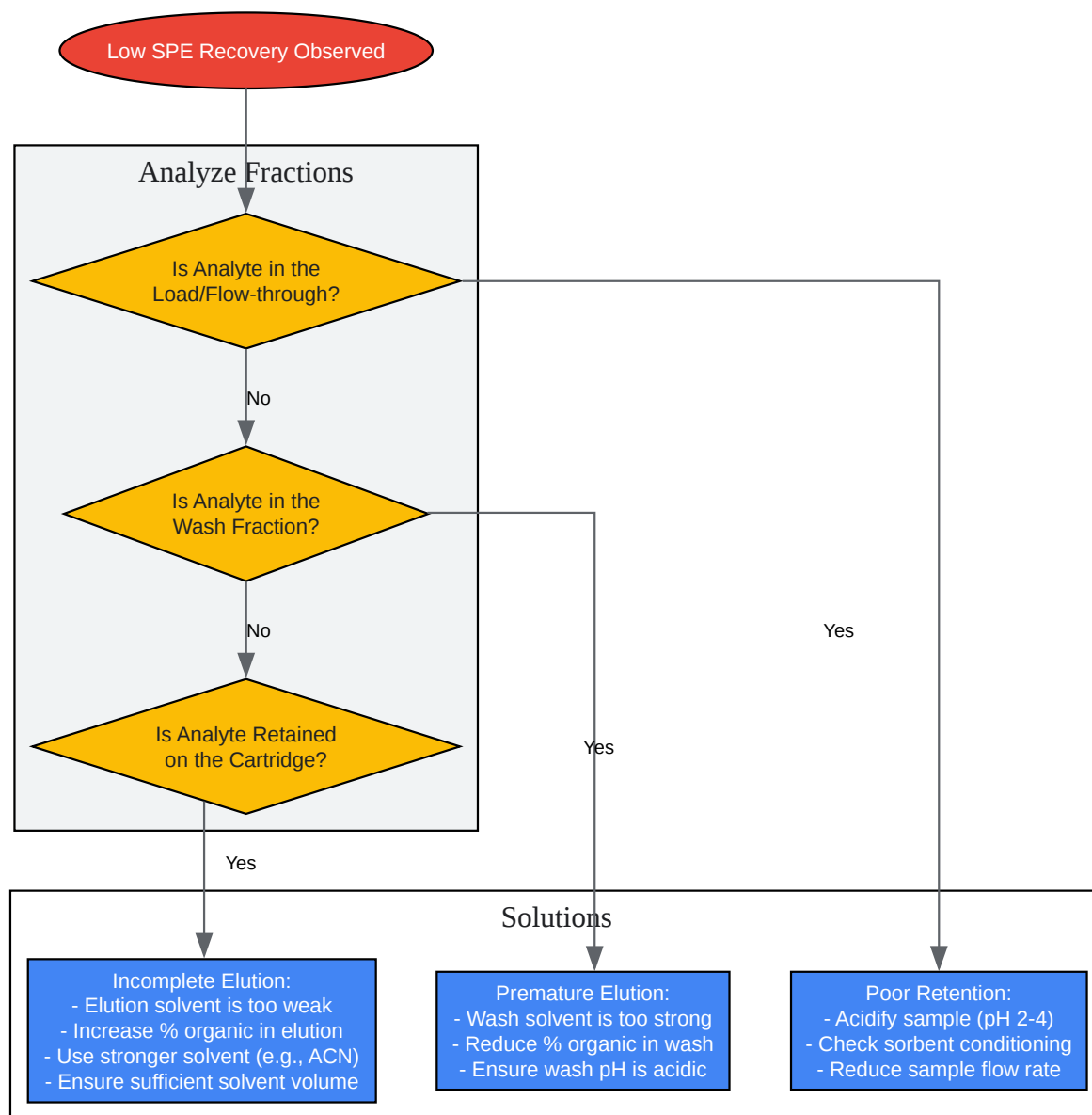
SPE Troubleshooting Logic

Click to download full resolution via product page