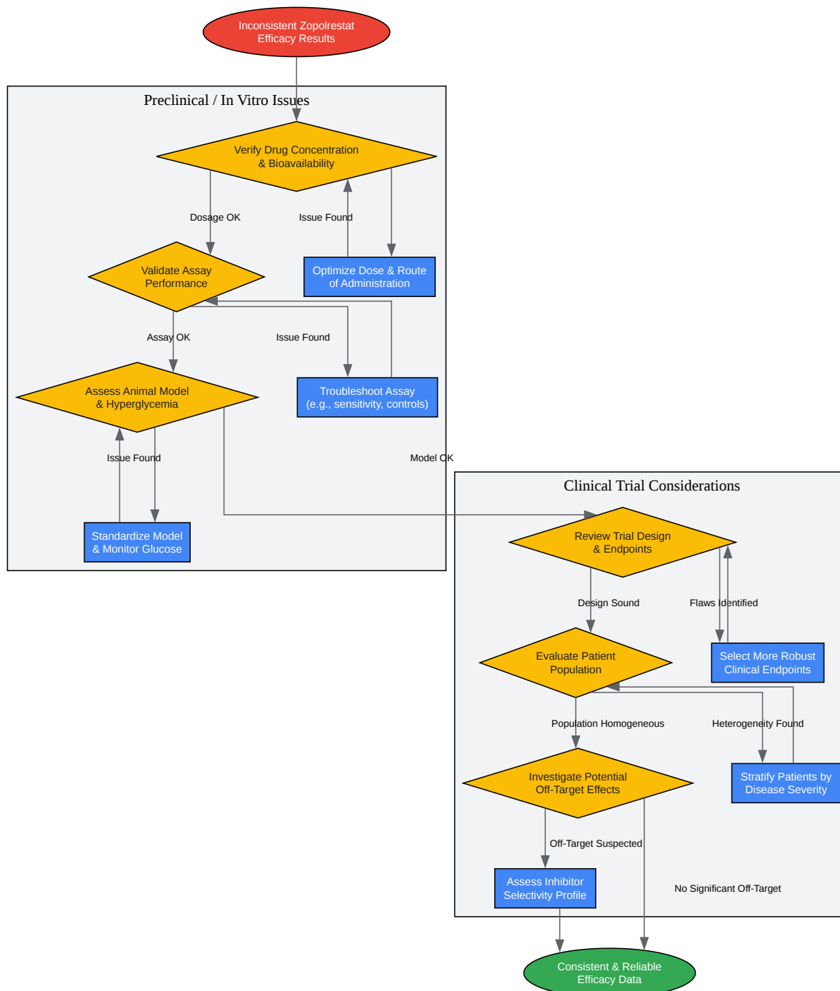
Caption: In Vivo Experimental Workflow for Zopolrestat Efficacy Testing.

Click to download full resolution via product page