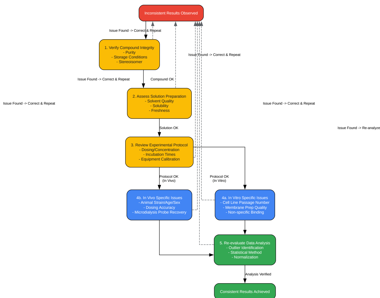
Diagram: Troubleshooting Workflow for NBI-98782 Experiments