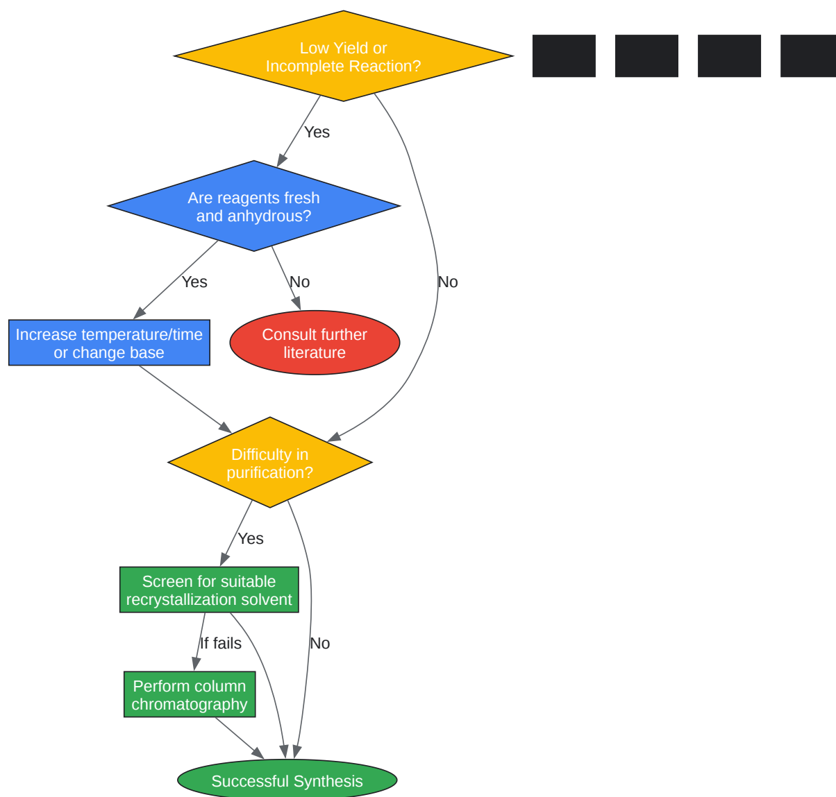
Figure 3. Troubleshooting Decision Tree

Click to download full resolution via product page