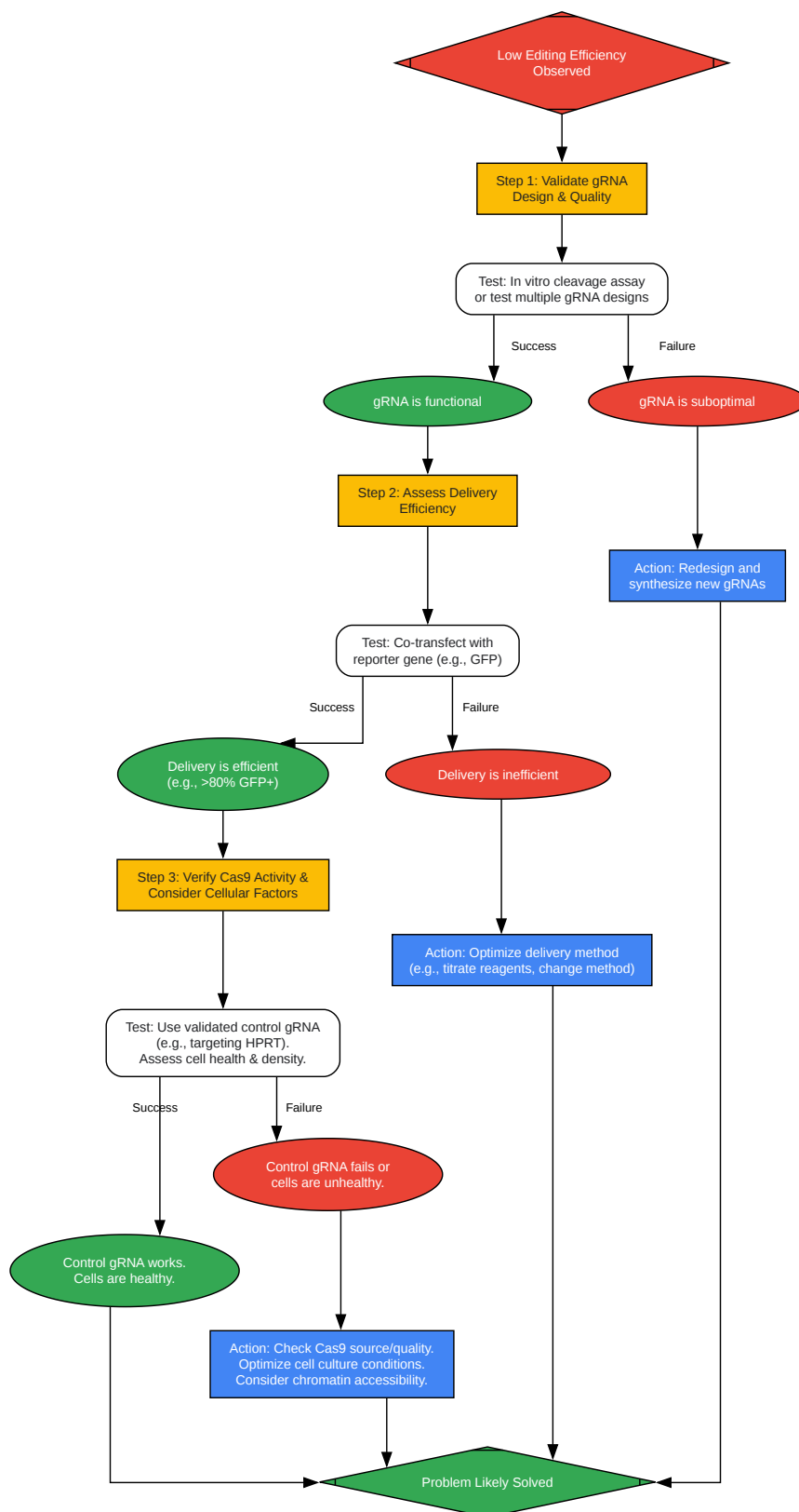
Diagram 1: Troubleshooting Workflow for Low CRISPR-Cas9 Editing Efficiency