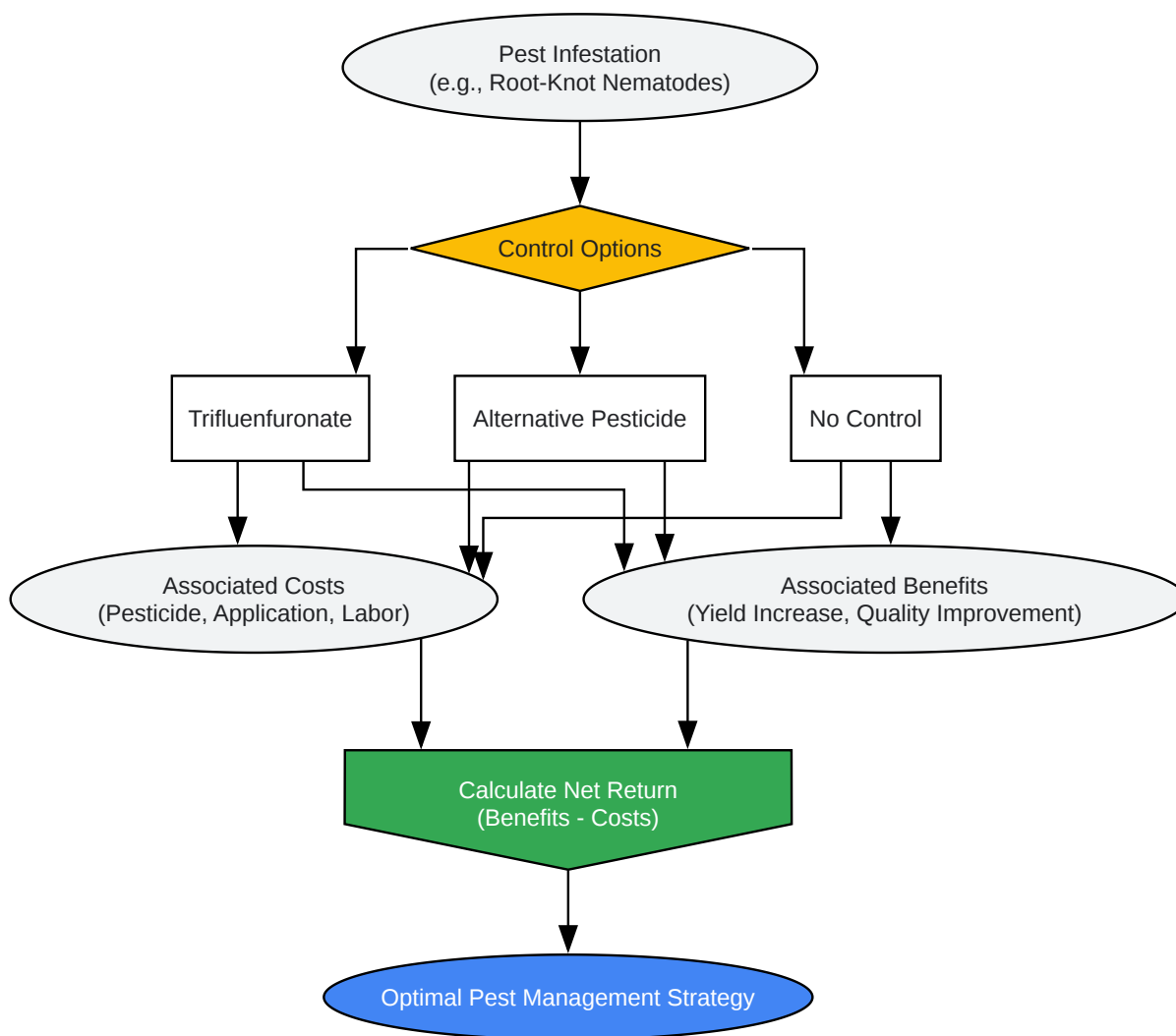
Figure 2: A typical experimental workflow for pesticide evaluation.

Click to download full resolution via product page