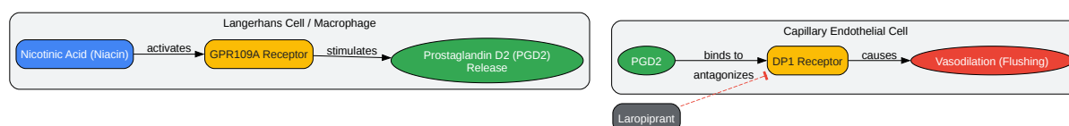
Diagram of the Niacin-Induced Flushing Pathway:

A3: Niacin-induced flushing is primarily mediated by the activation of the G protein-coupled receptor 109A (GPR109A) on dermal Langerhans cells and macrophages.[9][10] This activation leads to the production and release of prostaglandin D2 (PGD2). PGD2 then binds to the prostaglandin D2 receptor 1 (DP1) on capillary endothelial cells, causing vasodilation and the characteristic flushing symptoms.[11][12]