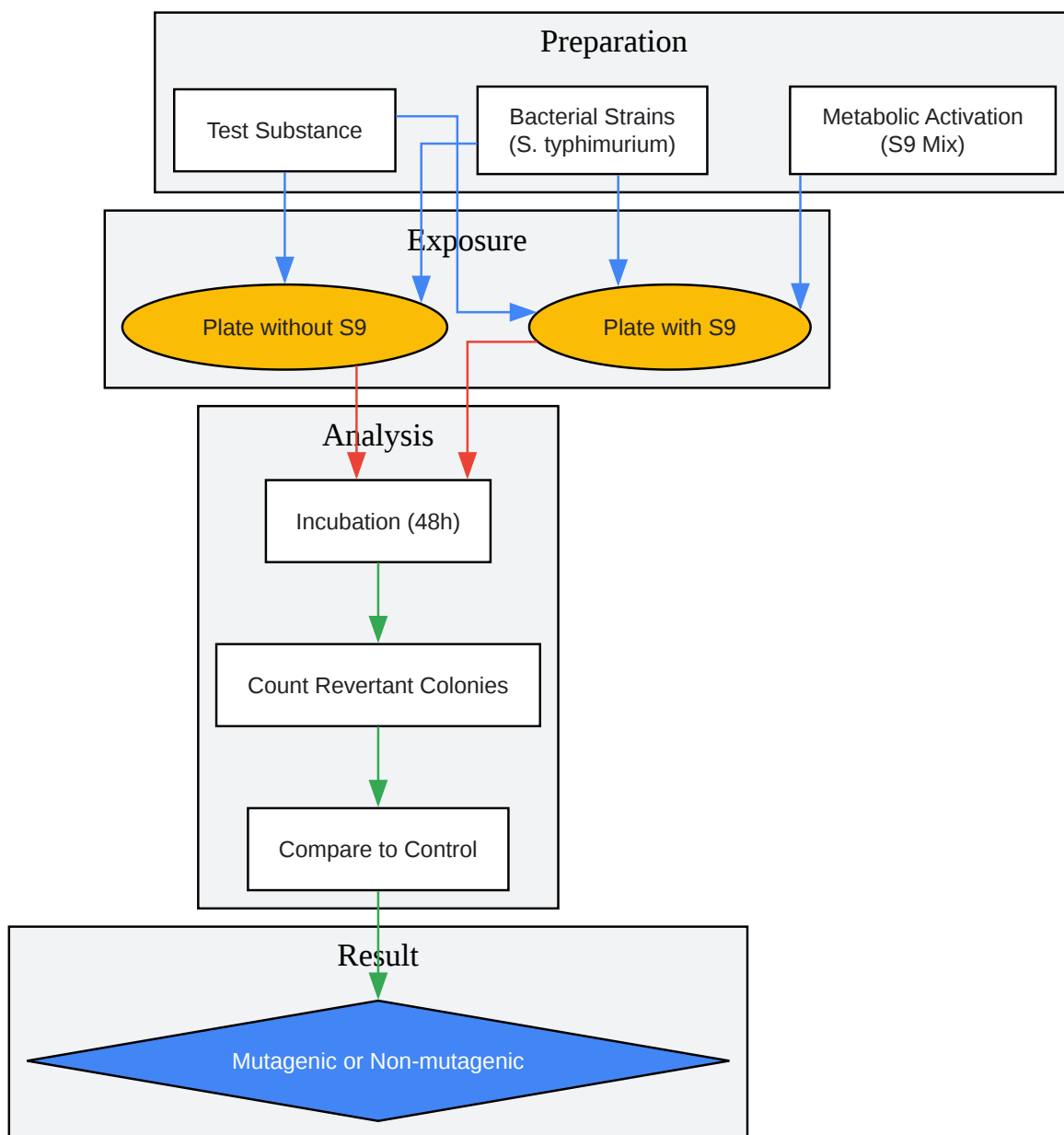
Figure 1: Workflow for the OECD 414 Developmental Toxicity Study.

Click to download full resolution via product page