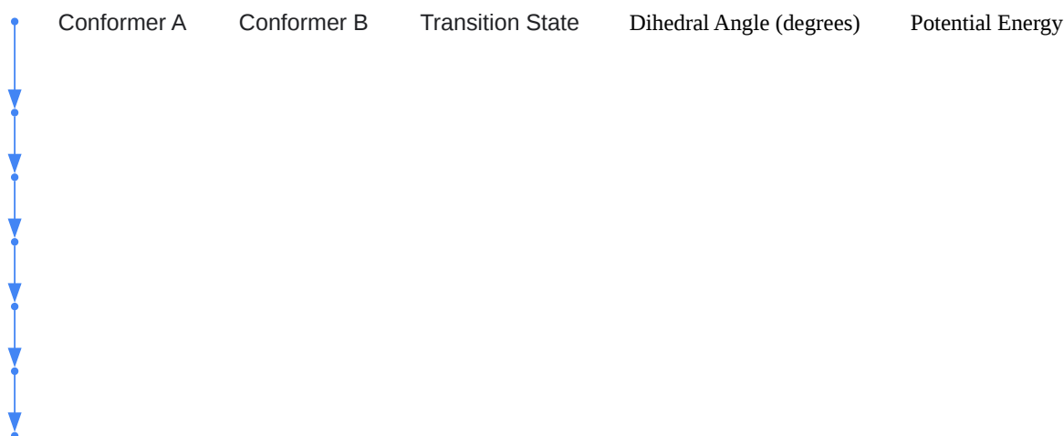
Figure 3. Hypothetical Potential Energy vs. Dihedral Angle

Click to download full resolution via product page