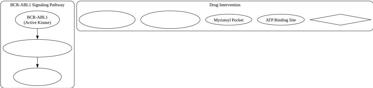
Table 2: Clinical trial data for Asciminib in combination with orthosteric TKIs in CML patients. [3]