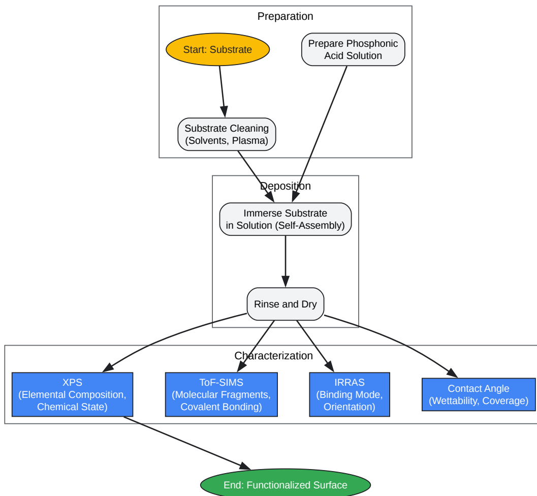
General Workflow for SAM Formation and Characterization

Click to download full resolution via product page