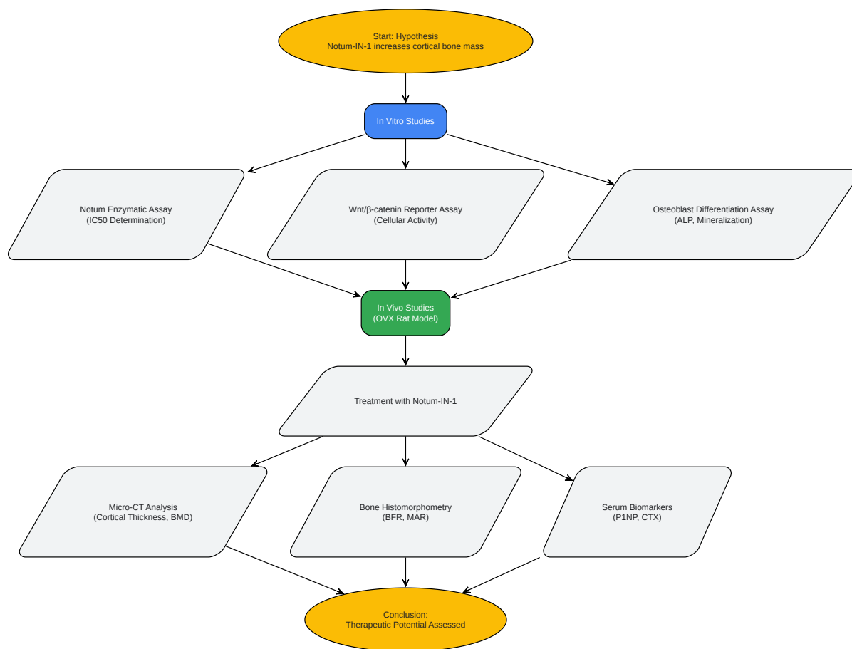
Figure 2: Experimental Workflow for Notum-IN-1 Evaluation

Click to download full resolution via product page