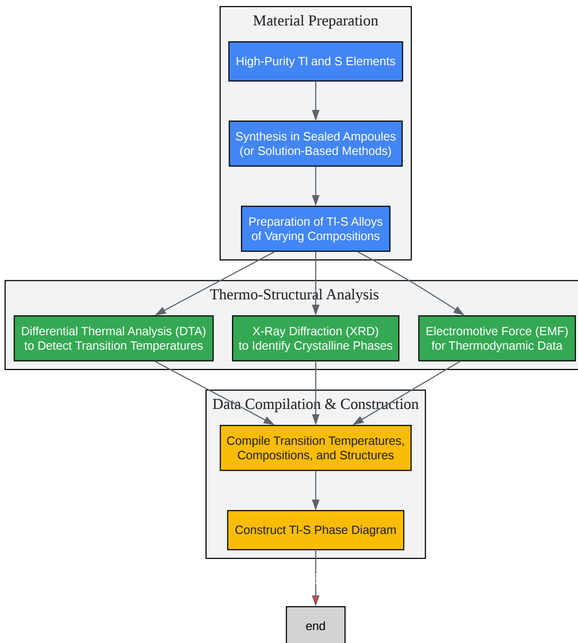
Experimental Workflow for TI-S Phase Diagram Analysis