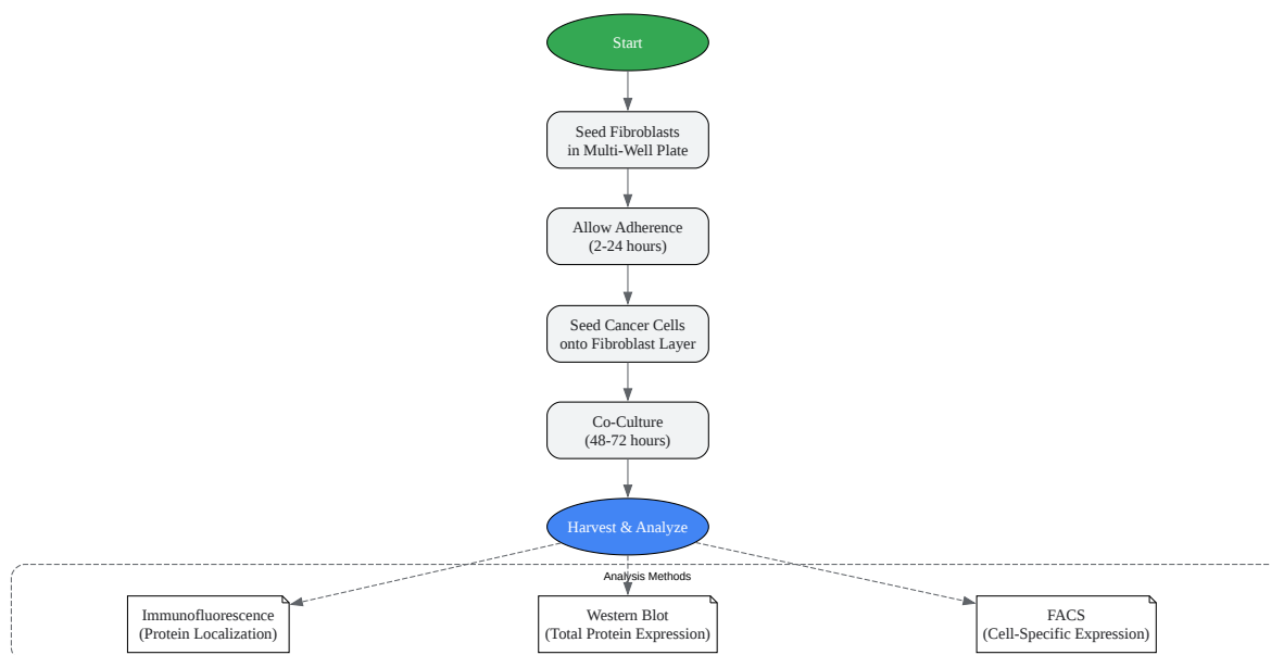
Diagram: Co-Culture Experimental Workflow