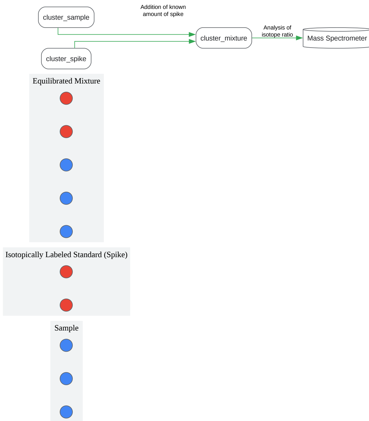
Diagram: Core Principle of Isotopic Dilution Mass Spectrometry

Click to download full resolution via product page