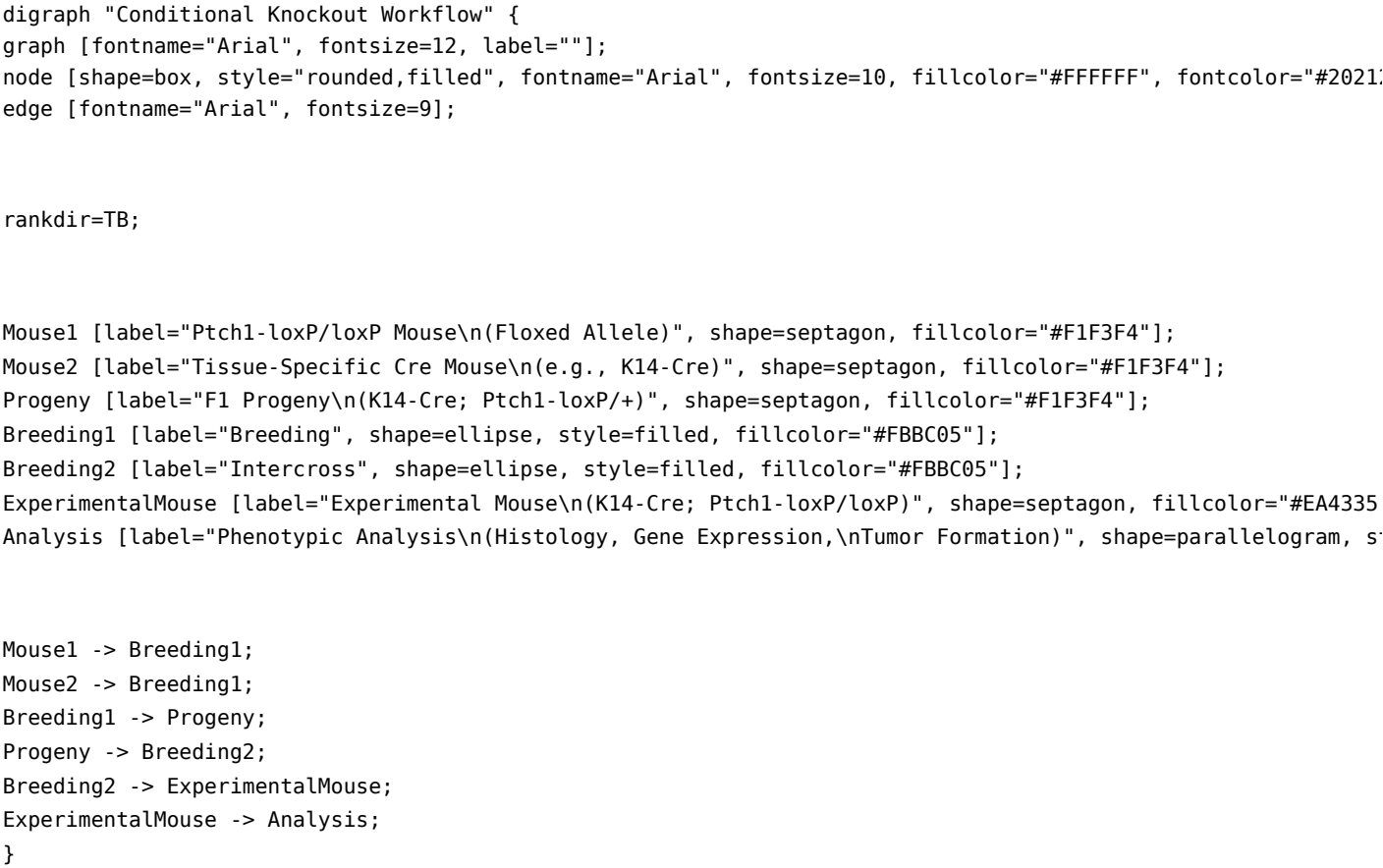
Caption: Workflow for generating a tissue-specific PTCH1 knockout mouse

Quantitative Reverse Transcription PCR (RT-qPCR) is the standard method for quantifying PTCH1 mRNA levels, providing insights into the activity of