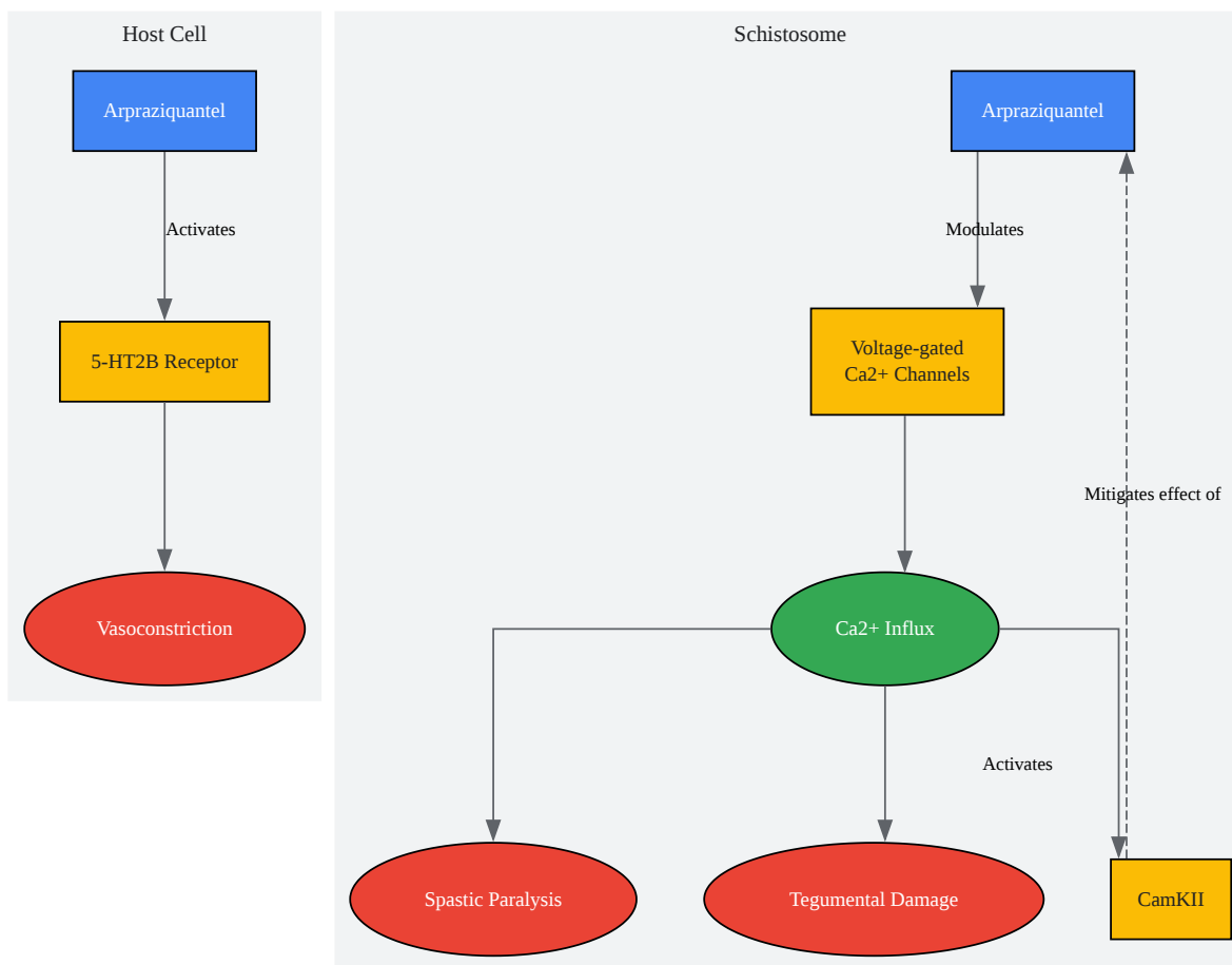
Simplified Proposed Mechanism of Action of Arpraziquantel