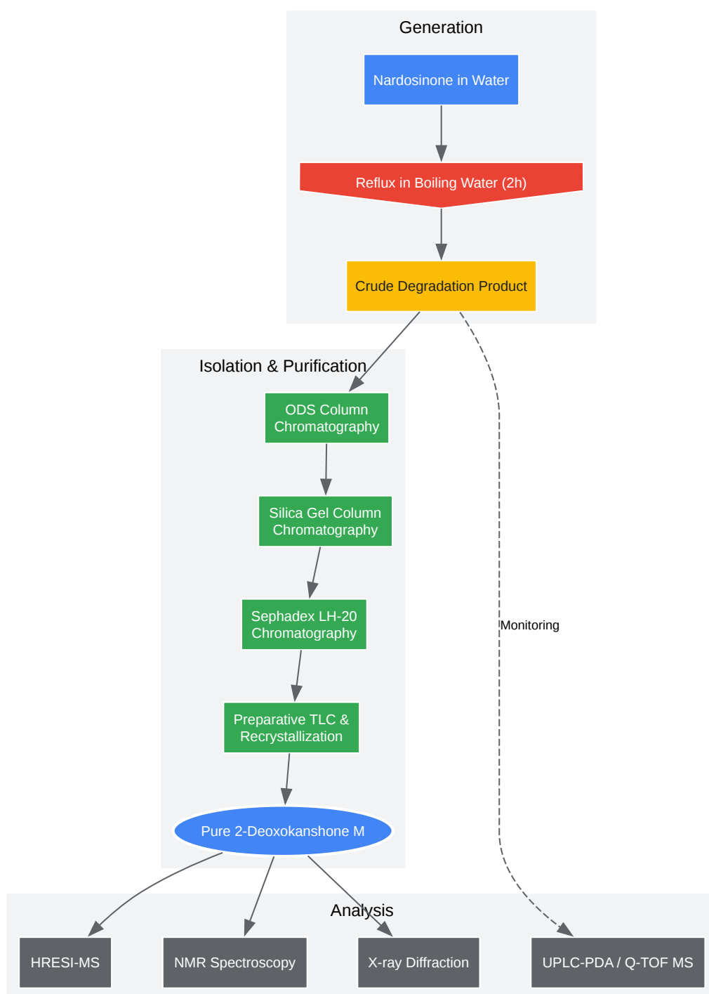
Experimental Workflow for 2-Deoxokanshone M