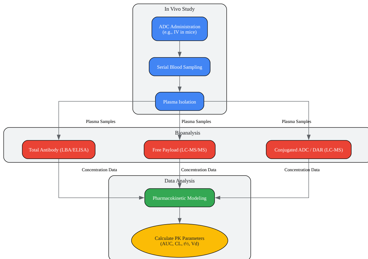
Figure 2. Preclinical ADC Pharmacokinetic Workflow

Click to download full resolution via product page