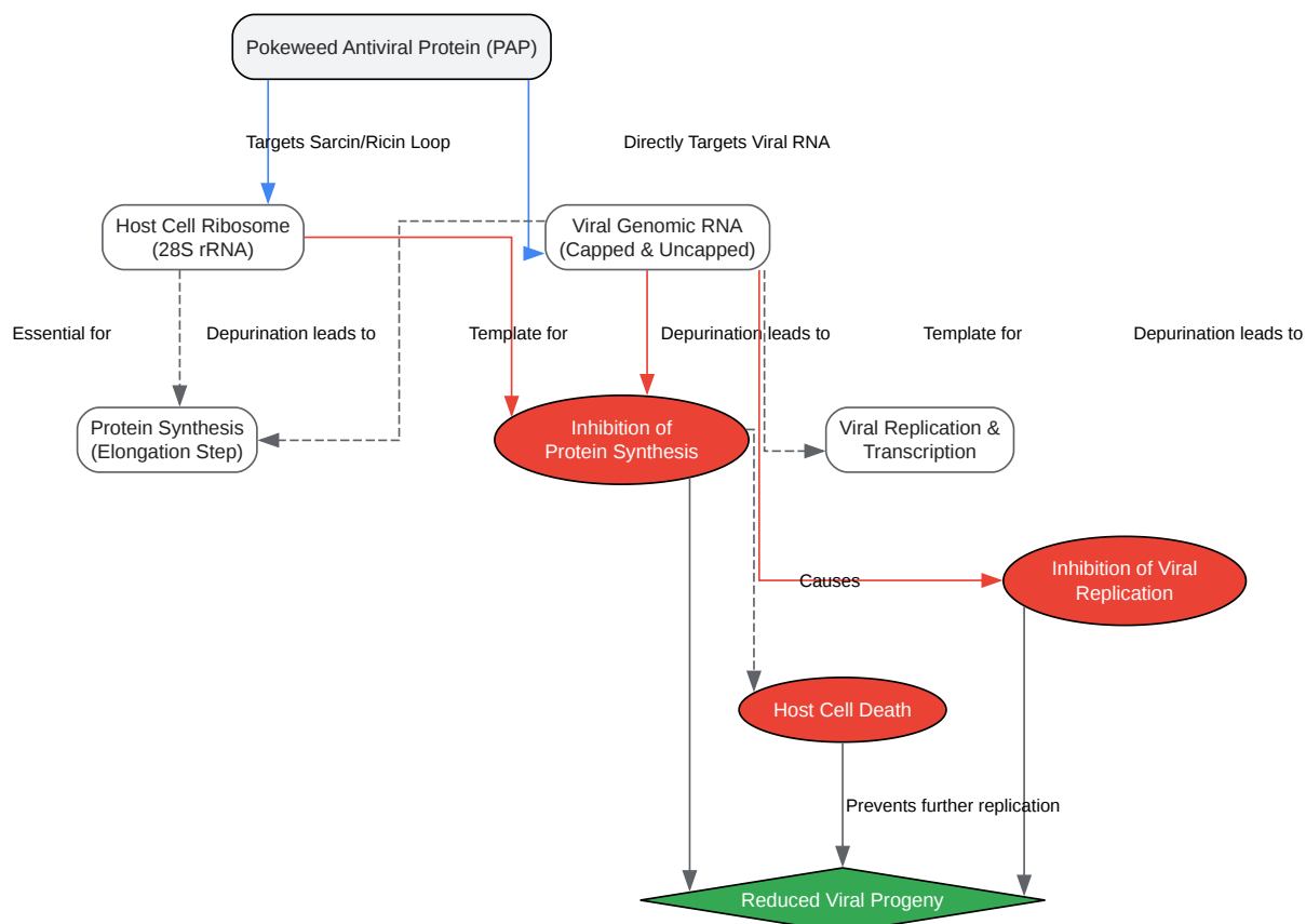
Figure 1: Core Antiviral Mechanisms of Pokeweed Antiviral Protein (PAP)

Click to download full resolution via product page