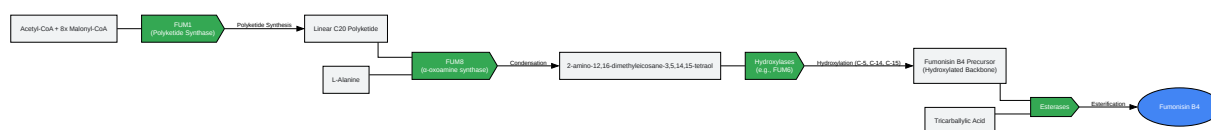
Diagram of the Fumonisin B4 Biosynthetic Pathway

Click to download full resolution via product page