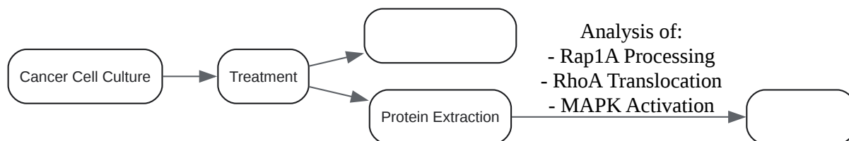
Figure 1: Mechanism of Action of GGTI-286.

Click to download full resolution via product page