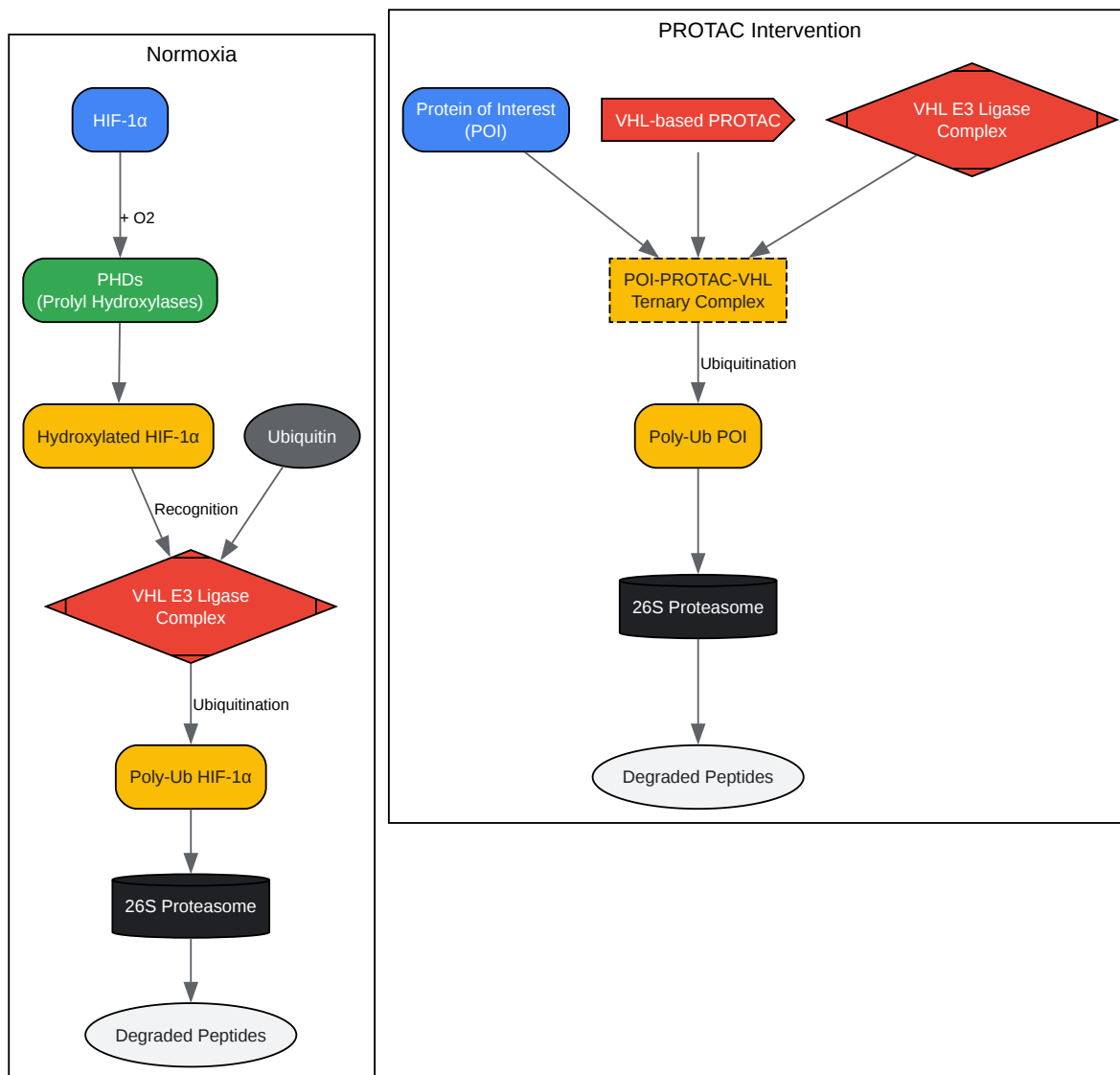
VHL-Mediated Degradation of HIF-1 \alpha and its Hijacking by PROTACs

Click to download full resolution via product page