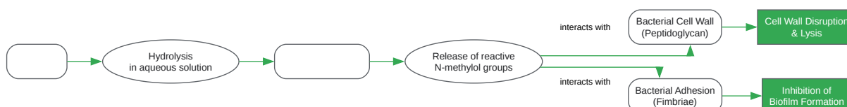
Diagram: Proposed Mechanism of Action of Taurultam

Currently, there is limited specific information available regarding the direct interaction of Taurultam with bacterial signaling pathways, such as quorum sensing. The primary described mechanism is a direct chemical interaction with the bacterial cell wall and surface appendages. [1][5] However, by preventing initial adhesion and subsequent biofilm formation, Taurultam indirectly disrupts the cell-to-cell communication and signaling cascades that are crucial for biofilm maturation.