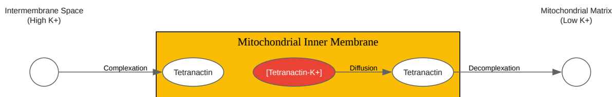
Diagram of the Ionophoric Mechanism: