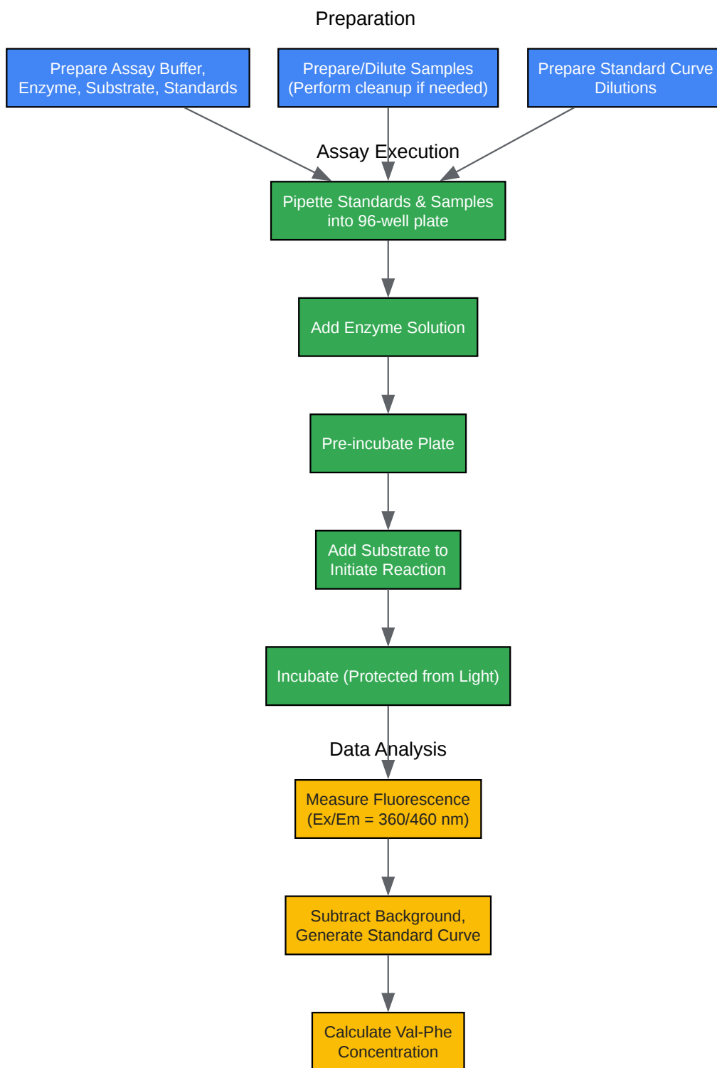
Val-Phe Detection Assay Workflow