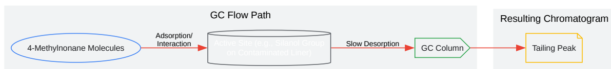
Caption: Troubleshooting workflow for peak tailing.

Click to download full resolution via product page