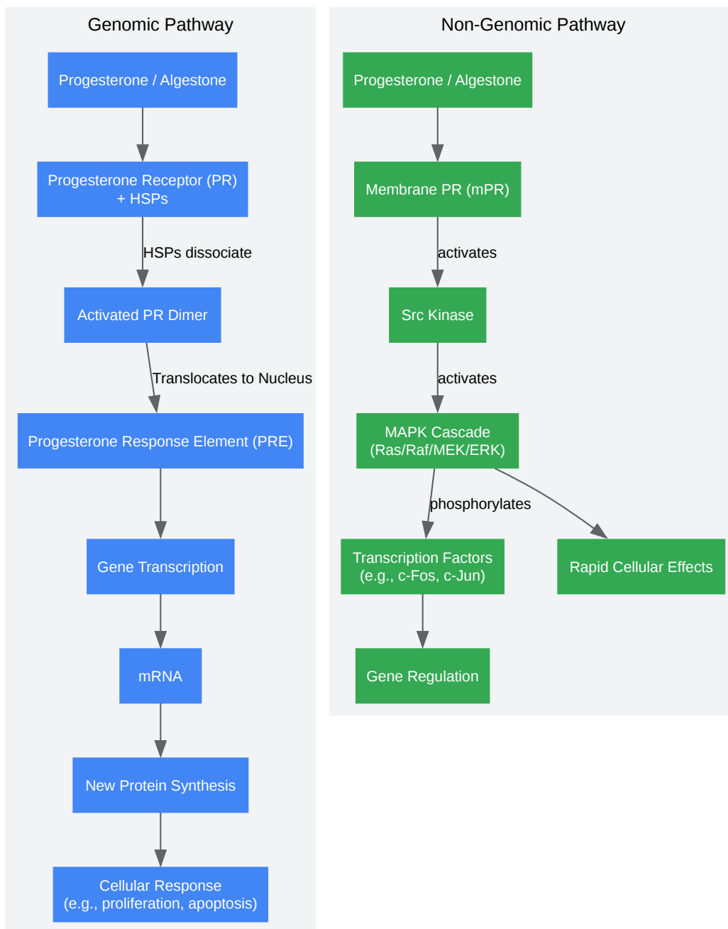
Progesterone Receptor Signaling Pathways

Click to download full resolution via product page