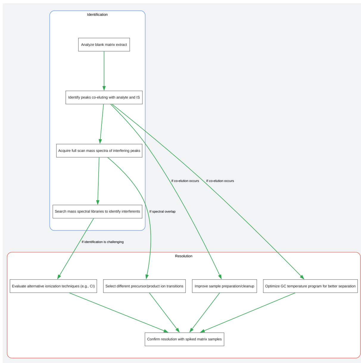
Diagram: Troubleshooting Matrix Interferences

Click to download full resolution via product page