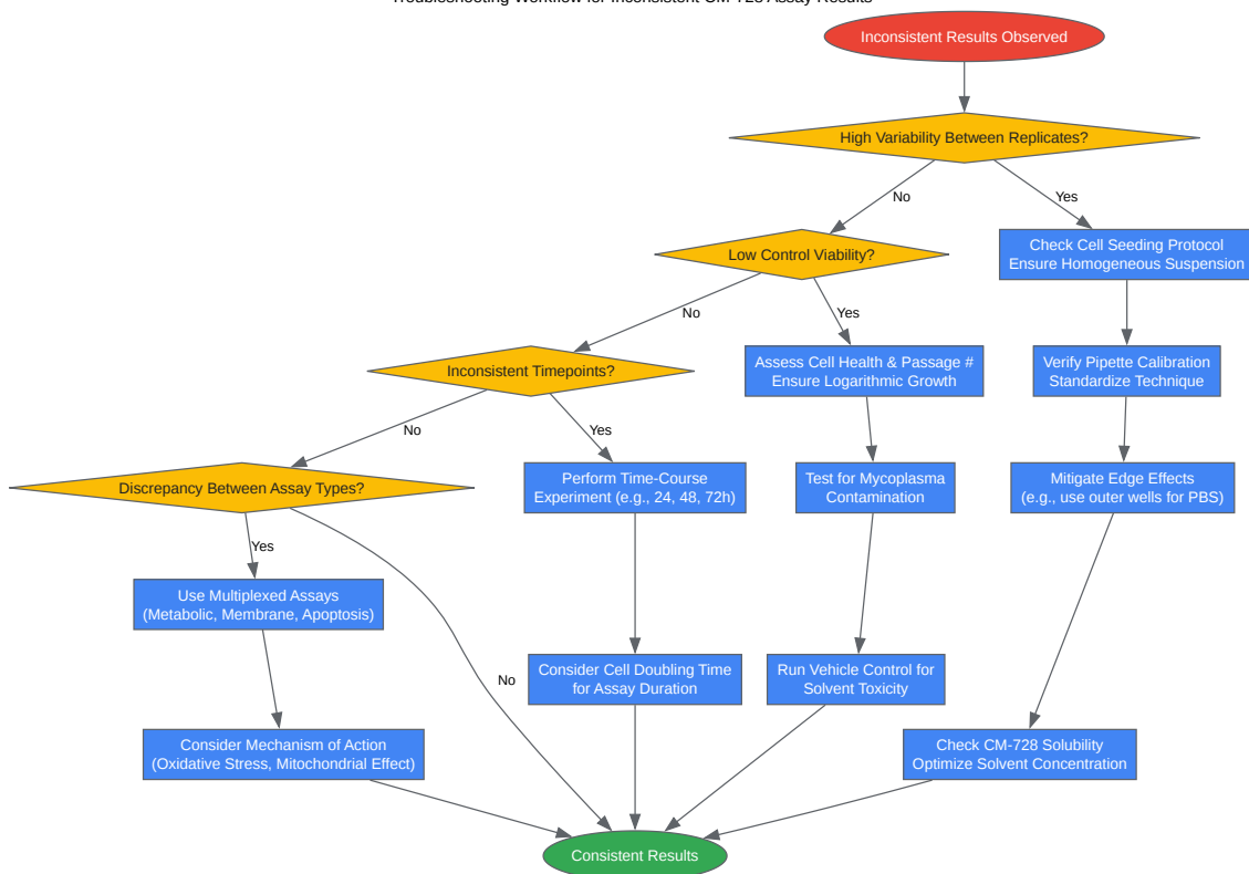
Troubleshooting Workflow for Inconsistent CM-728 Assay Results