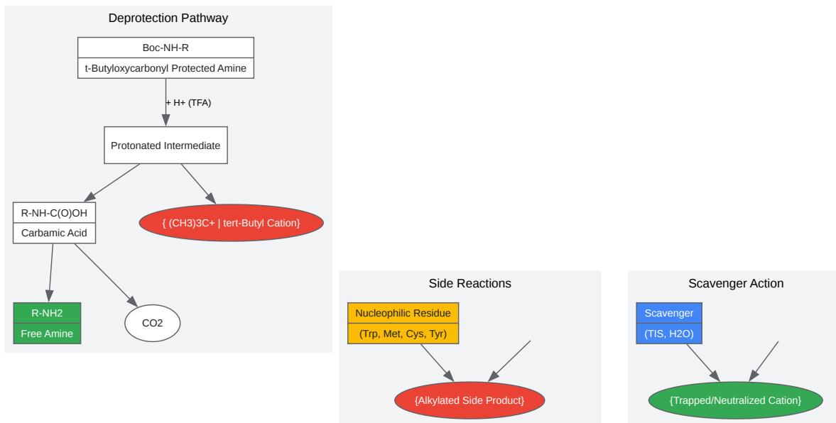
Mechanism of Boc Deprotection and Role of Scavengers

Click to download full resolution via product page