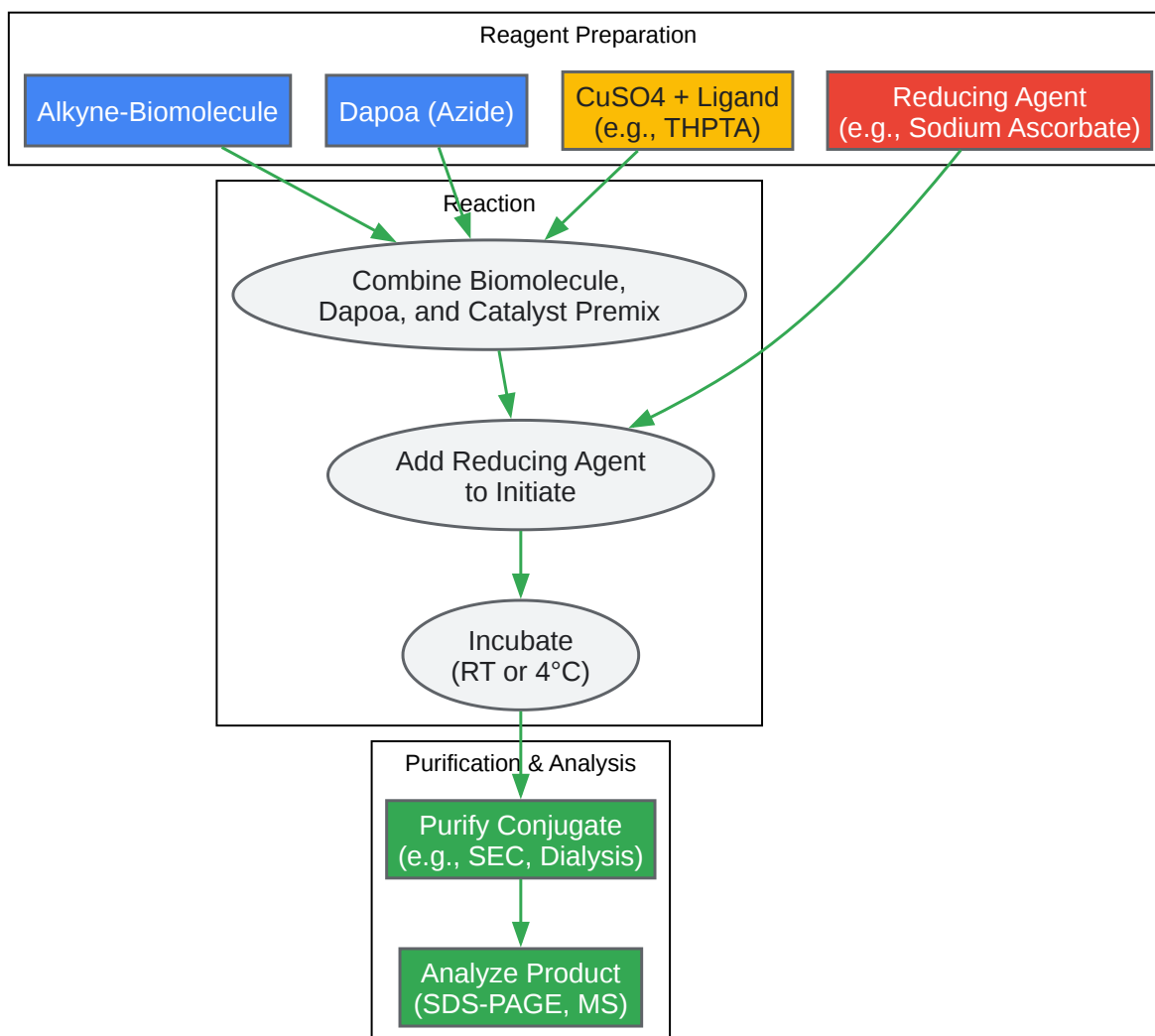
Figure 1: Experimental Workflow for CuAAC

Click to download full resolution via product page