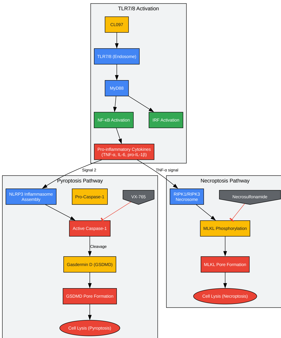
CL097 Signaling and Cytotoxicity Pathways