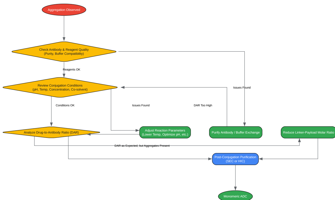
Troubleshooting Aggregation During Antibody Conjugation

Click to download full resolution via product page