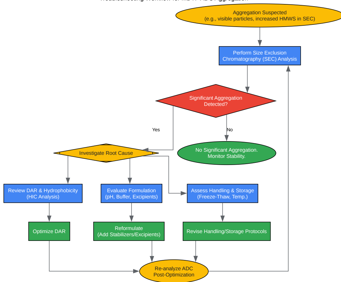
Troubleshooting Workflow for MDTF ADC Aggregation