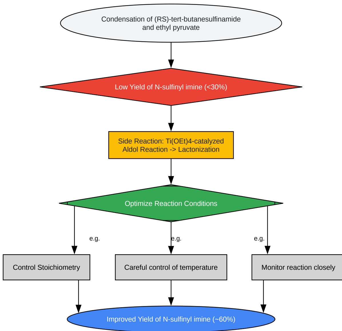
Caption: Convergent total synthesis workflow for JBIR-22 .

Click to download full resolution via product page