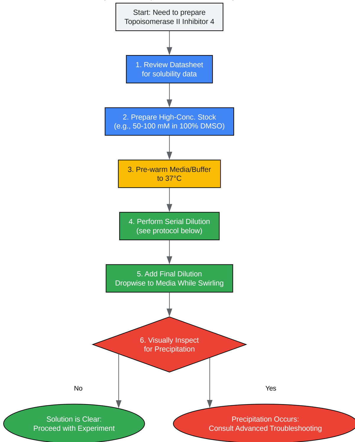
Diagram 1: Precipitation Troubleshooting Workflow