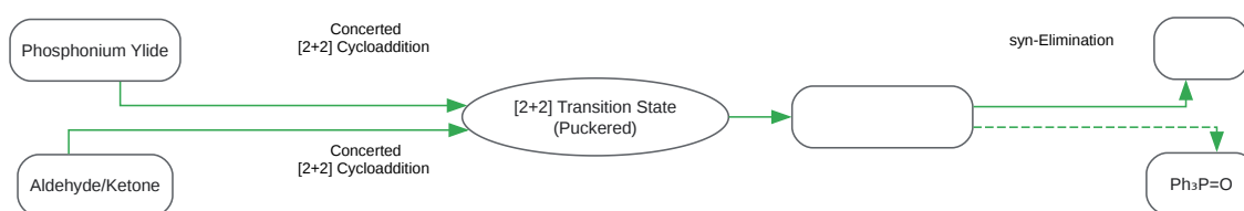
Fig. 1: Salt-Free Wittig Reaction Pathway

Click to download full resolution via product page