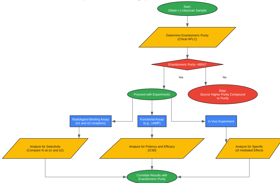
Experimental Workflow for Assessing Impact of Idazoxan Enantiomeric Purity

Click to download full resolution via product page