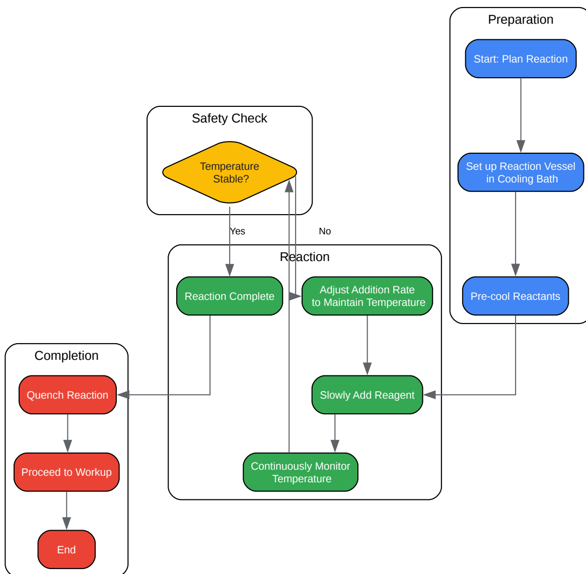
Workflow for Temperature Control in Exothermic Reactions