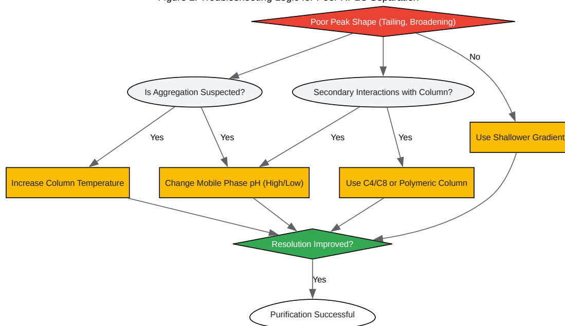
Figure 2. Troubleshooting Logic for Poor HPLC Separation

Click to download full resolution via product page