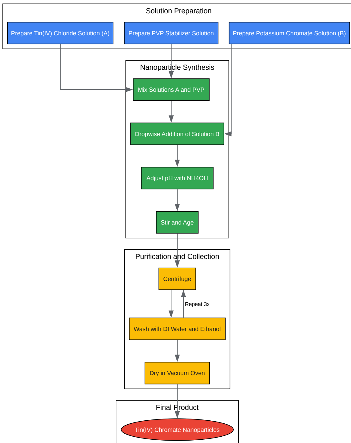
Experimental Workflow for Co-Precipitation Synthesis

Click to download full resolution via product page